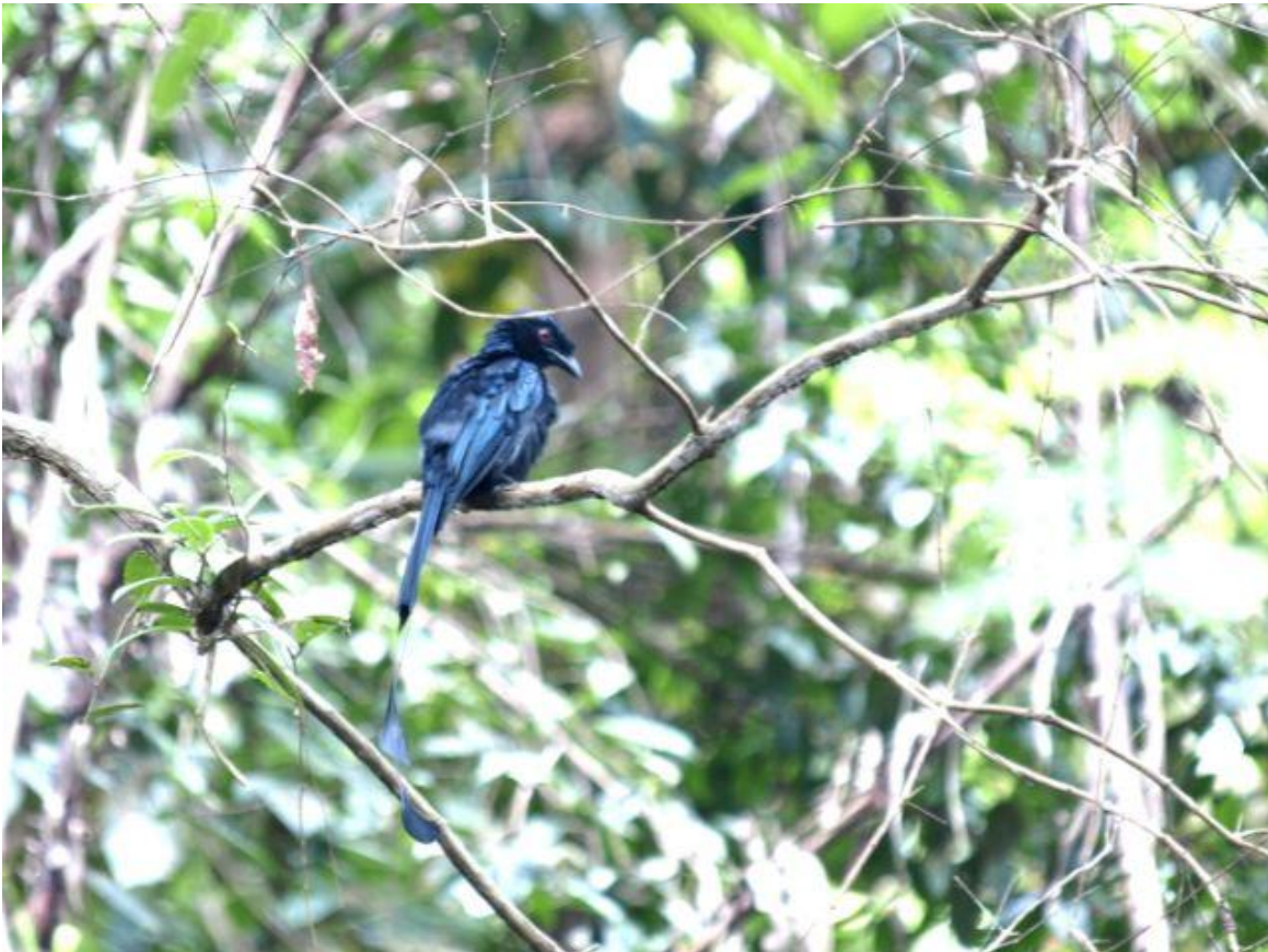
Greater Racket-tailed Drongo Dicrurus paradiseus at Central Catchment Nature Reserve.

The full moon meant that finding owls would be a problem and so it proved. Near the highest point of the path leading to Upper Peirce Reservoir, we heard a Collared Scops Owl calling. It was too far inside the forests so we moved on. At an open area with tall terentang trees, we found three calling Brown Hawk-owls . Despite waiting for some time, we only got a glimpse of one flying into foliage. The tall trees foiled our attempts to get better looks at the sky brightened almost immediately.