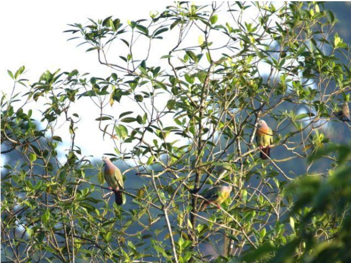
A flock of Pink-necked Green Pigeons Treron vernans at MacRitchie Reservoir.