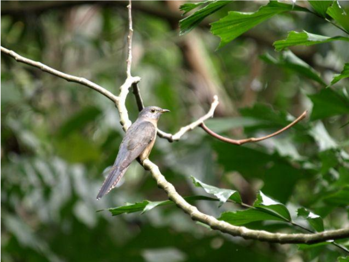
Adult Rusty-breasted Cuckoo Cacomantis sepulcralis at Sungei Buloh.

The highlight of our walk at Sungei Buloh Wetland Reserve was an adult Rusty-breasted Cuckoo near the Freshwater Pond. It flew in and perch on a branch for over ten minutes, giving us very good looks.