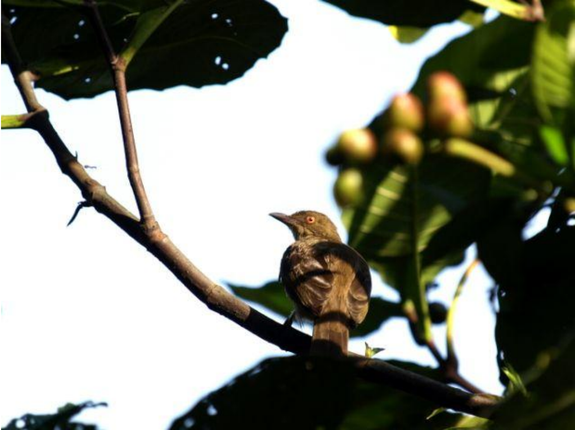
Red-eyed Bulbul Pycnonotus brunneus at a Dillenia bush at MacRitchie Reservoir.

We lingered until around 10 am before deciding to head back. More birds were picked up along the way including an obliging Banded Woodpecker , a close-up Chestnut-winged Babbler and two Crimson Sunbirds at the tapioca patch.