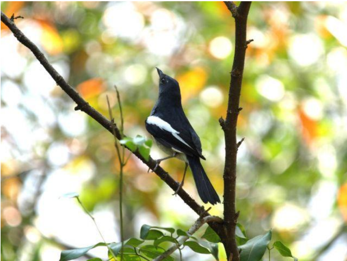
A male Oriental Magpie-robin Copsychus saularis singing at Sungei Buloh.

Near Hide 1E, we found a pair of Common Tailorbirds foraging actively next to a pair of Ashy Tailorbirds , a Brown-throated Sunbird and a pair of Pied Fantails . We also located a group of five Oriental Magpie-robins that was actively engaged in song, posturing and short chases in the woods.